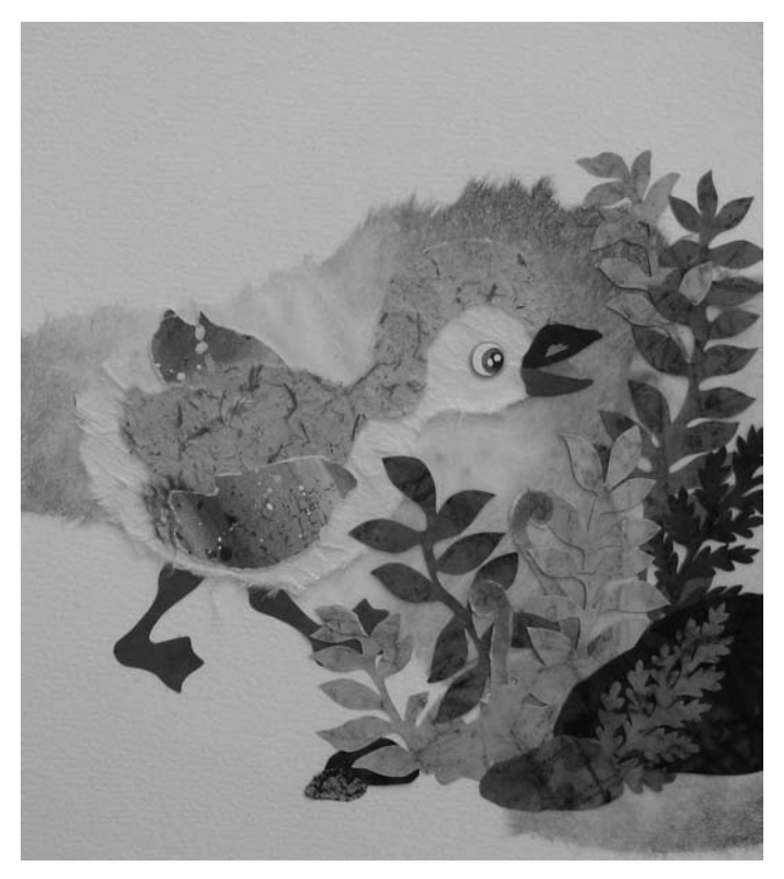
illustration by Yuko Green

reprinted with permission from Tales of Tūtū Nēnē and Nele , written by Gale Bates, illustrated by Yuko Green, published by Island Heritage Publishing © 2011 Island Heritage Publishing